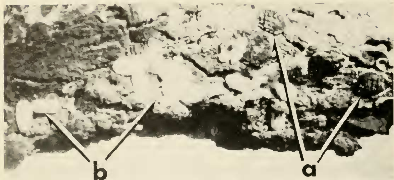
Fig. 1. Acalyptococcus eugeniae . a, adult females on host, Eugenia linocieroides , and showing powdery wax around margin. b, male pupal cocoons in cluster on host.

has a single distal orifice compared to bilocular openings in Scutarea . Other distinct differences between the two genera are the arrangement of cruciform pores and the majority of the pores on the margin and abdomen are quinquelocular in Acalyptococcus rather than septilocular as in Scutarea .